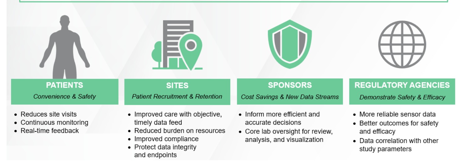
Figure 1. The advantages of using remote biosensors in clinical research.